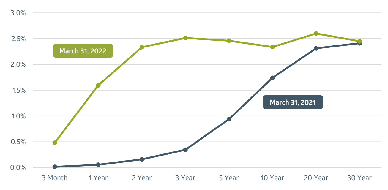
Flattening Out: Comparing the U.S. Treasury Bond Yield Curve to One Year Ago

Source: Federal Reserve, as of 3/31/2022.